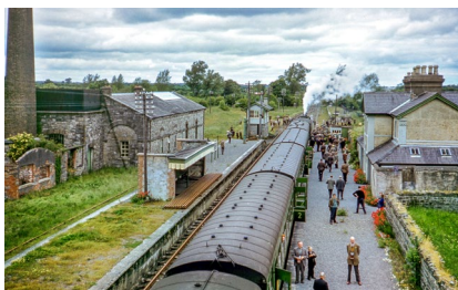
Kilmessan Station 3rd June 1961