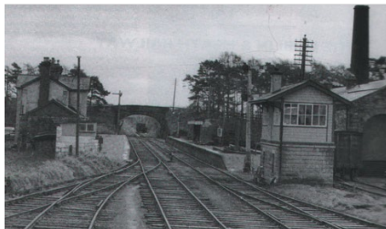
Kilmessan junction looking east with the old D&M locomotive shed and the signal box on the right